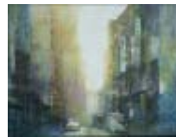
Mei Shu Radford, VA City Morning Mixed