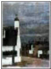
Leslye Bloom Blacksburg, VA Promise of Sun Encaustic Computage